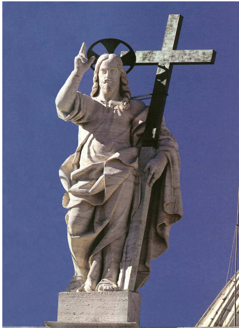
Photo. 3. Statue of Christ on the facade of St Peter's Basilica in the Vatican.

Unfortunately, under the current state of affairs, which seems to be deliberately maintained by the administration of the Egyptian Museum, the “riddle” of the mysterious Sabu Disk will never be resolved. Despite considerable public interest in the artifact (which is, however, largely artificially inflated, like everything related to Ancient Egypt), the study of the disk is in fact currently blocked.