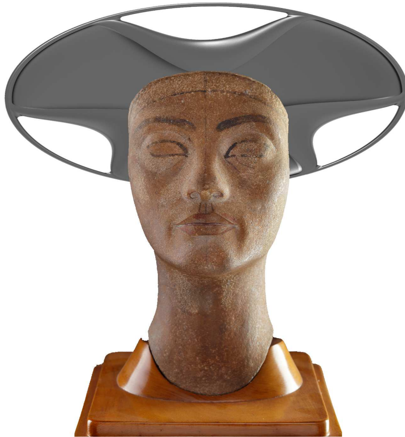
Fig. 1. Sabu Disk virtually placed on the tenon of Nefertiti's head. A 3D model of the disk was used as its image. The size of the "hat" has been reduced relative to the size of the head.

To more precisely determine the material and the fabrication technology of the disk, more information about it is needed. Thus, for example, the curved and elongated structure of the material at the bases of the petals, where they were subjected to severe bending deformation, may indicate modeling. The modeling may also be indicated by the elongated structure of the petal material in areas where the petals were significantly stretched by rolling in the radial direction. The bending and rolling were most likely performed on a rigid mandrel of a specific shape.