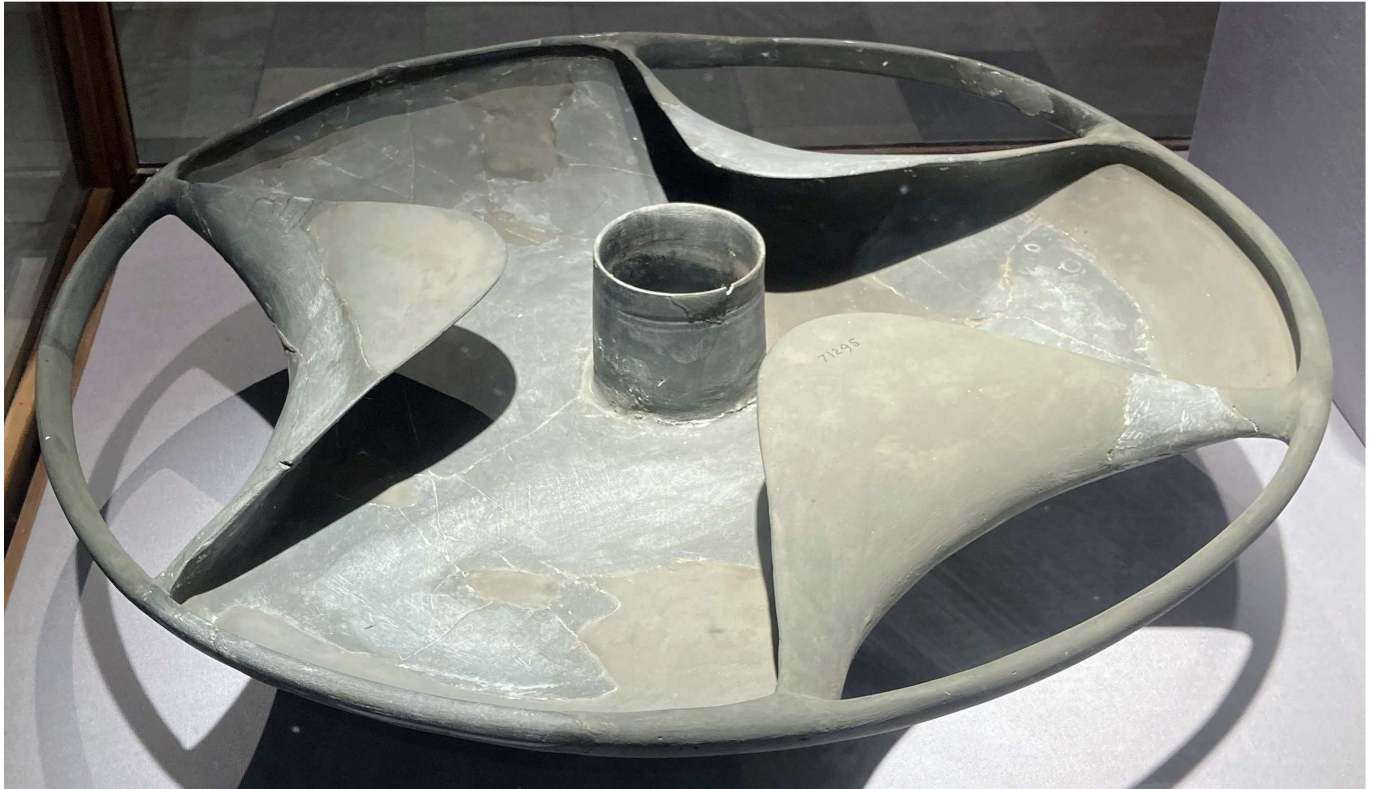
Photo. 1. Sabu Disk, Egyptian Museum, Cairo. Diameter: 61 cm; height: 10.6 cm; inner diameter of the bushing: 8 cm. Material: metasiltstone. Ninety years have passed since the discovery of this “mysterious” artifact, yet no mortal has seen the reverse side of this disk.

(see Photo. 3). The only difference is that the nimbus of the statue of Christ has four rays (spokes) forming an equilateral cross, and it has no bent “petals”.